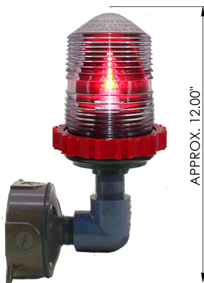
120 BOB - 12 - L - 180 - R 24

Special Screen for double-opening swing bridges and single opening draw bridges 33 CFR, 118.70 and 118.75