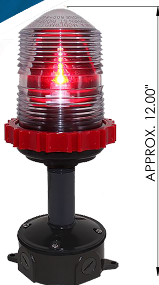
120 BOB - 12 - R 24

Special Screen for double-opening swing bridges and single opening draw bridges 33 CFR, 118.70 and 118.75